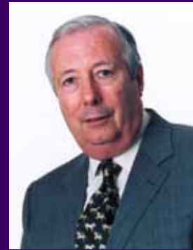
Lord Harris of Peckham Sponsor of the Harris Academy Falconwood

I hope you will come along to our Open Evening to see for yourself the difference the Academy is making."