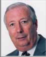
Lord Harris of Peckham Sponsor of the Harris Academy South Norwood